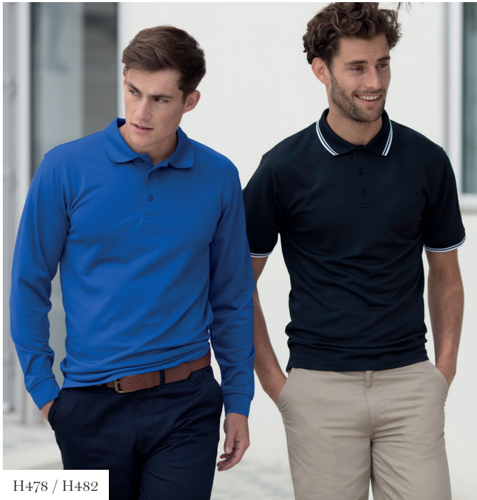
H478 / H482